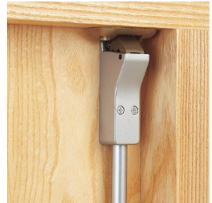
Optional pullman latches