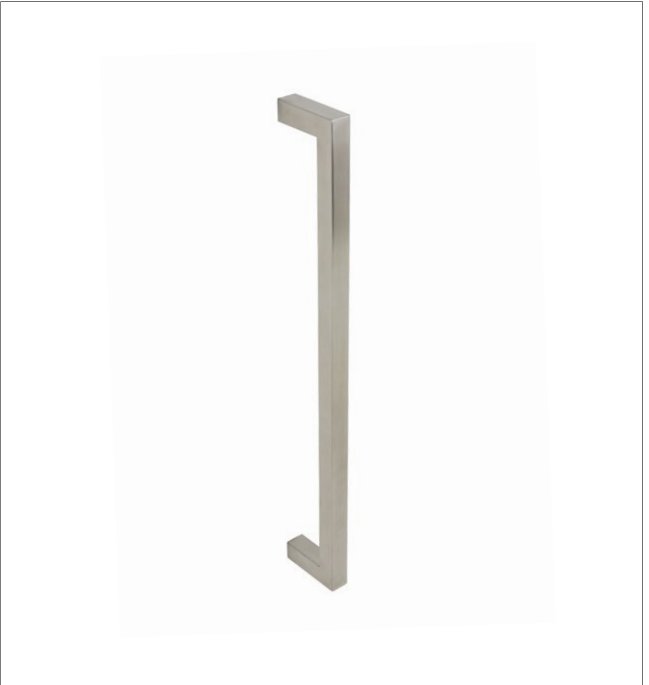
DDA Compliant - 316 Marine Grade Stainless Steel