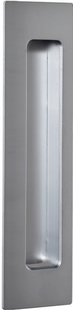
Right Hand Pull shown, also available Left Handed

Available in all standard Halliday + Baillie finishes. See finishes sheet for further details.