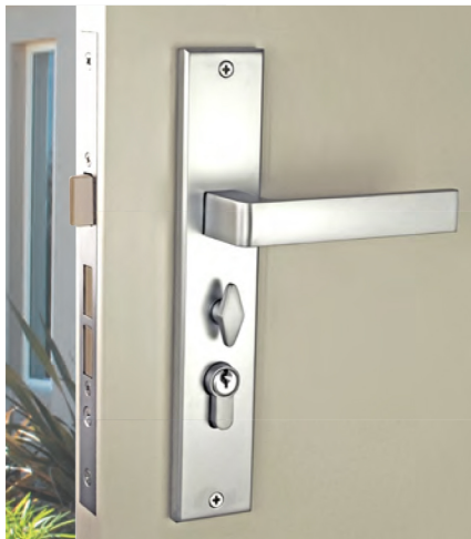
Inside View, OZI 1 mortice lock with Nidus Turin lever on longplate (right hand) with satin chrome (SC) finish.