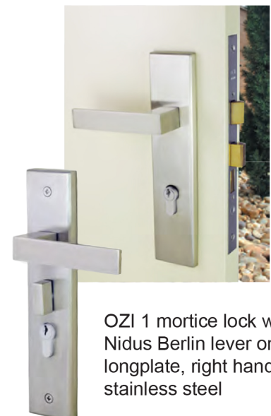
OZI 1 mortice lock with Nidus Berlin lever on longplate, right hand, stainless steel

PVD-BN = PVD Brushed Nickel with extended warranty. PVD-PB = PVD Polished Brass with extended warranty.