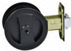
CSC-LK-RD entrance set SC, CP, BL