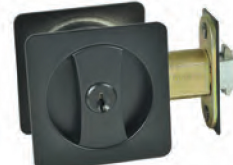
CSC-LK-SQ entrance set SC, CP, BL