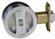
CSC-PRI-RD privacy set SC, CP, BL